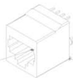
RJ45 TOP ENTRY JACK